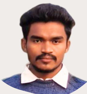
Golak Bihari Murmu